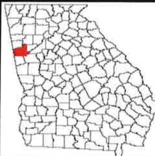
Figure 1 Project Location Map Carroll County Water Authority Indian Creek Water Supply Reservoir Water Quality Monitoring Plan Carroll County, Georgia 0 0.5 1 2 Miles Eco-Tech CONSULTANTS Print Date: 9/10/2019